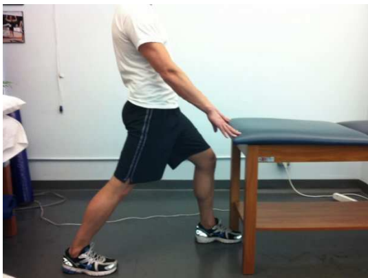
Standing Hip Flexor Stretch

The same stretches are performed below if patient has no stool: