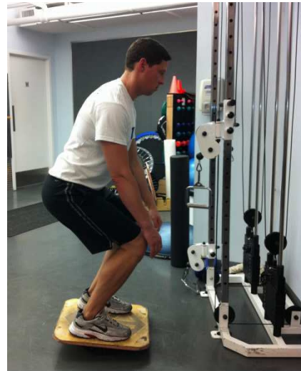
Mini Squats on Balance Board