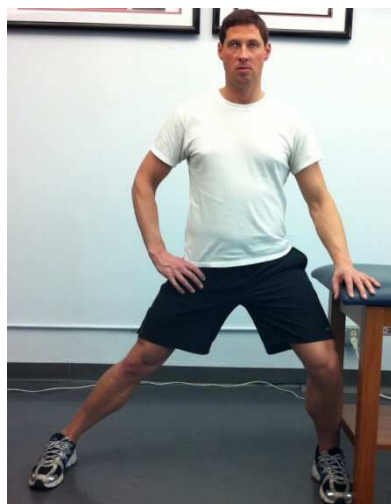
Standing Adductor Stretch