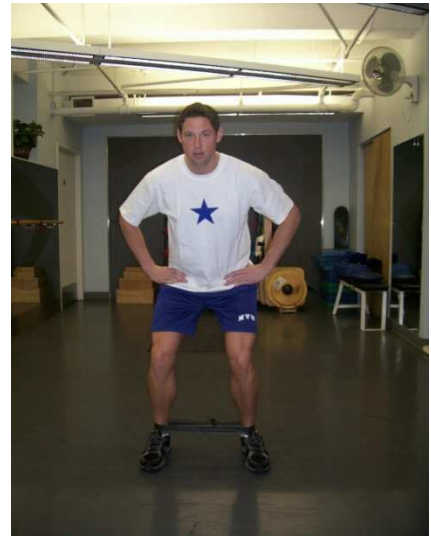
Side Stepping with Theraband