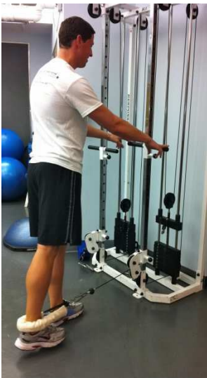
Cable Column Hip Extension